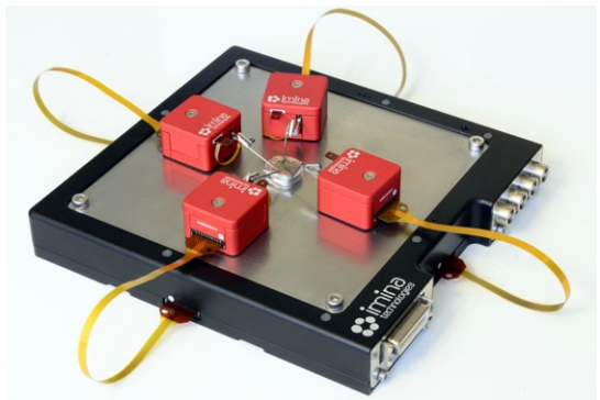
miBase BS-42 with four miBot manipulators

Ideal for labs with shared equipment, the miBase BS-43 makes installation and use of your miBots extremely convenient. The platform accommodates samples up to 5 cm (2") diameter. It offers several mounting interfaces that fit most optical and electron microscopes, and moving from one to another is a matter of minutes. It embeds a MultiBot controller which allows you to run up to 4 miBots with a single piezo driver (syDrive SD-15) and cabling is reduced to the minimum. Electrical signals can be measured or injected at the miBot probe tips by third party instruments by connecting them to the coaxial connectors on the front panel.