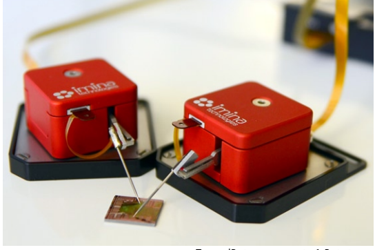
Two miBots on separate 1-Bot stages

Take full advantage of the ultra-small miBot size with platforms specifically designed to minimize their footprint on cluttered experimental setups and environmental chambers. The compact stages are available in various shapes and dimensions that accommodate 1, 2, or 4 miBots. Their mounting interfaces are compatible with standard optical breadboards and microscope stages, allowing you to easily reconfigure your setup for new experiments. Not directly attached to the sample, these stages are ideal for use at low optical working distance. They are also well adapted to contact large substrates mounted on sample holders that are moved by a positioning stage (e.g. wafer chucks, Petri dishes).