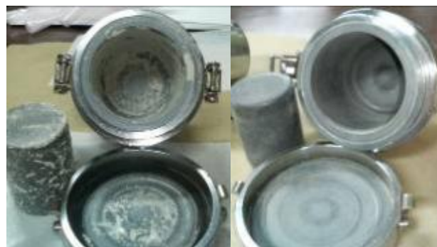
Without n-hexane (dry grinding) With n-hexane (wet grinding) Figure 1 Comparison of the condition in the container after pulverizing

Measurements were performed in vacuum on the Supermini200 with a 200 W Pd target X-ray tube for the components listed in Table 1. Measurement condition is shown in Table 2.